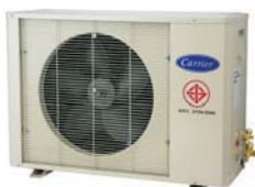
◀ 38RE-G2 Series

ลตจก. 2134-2545 : This standard cover room air conditioner of split type, having net total cooling effect not exceeding 12,000 watt.